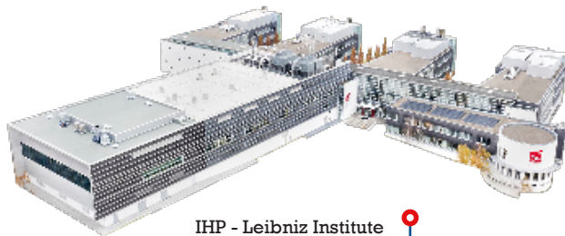
IHP - Leibniz Institute for High Performance Microelectronics