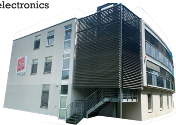
IHP - Leibniz Institute for High Performance Microelectronics

Your projects at its best. In Europe as well as in America or Asia